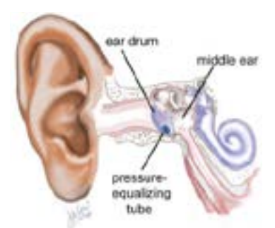
Figure 4: An ear tube in place in the eardrum