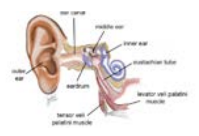
Figure 1: Normal ear showing the eustacian tube and the palatal muscle

Behind the eardrum is the middle ear. The middle ear is filled with air. It also contains tiny bones that connect the eardrum to the inner ear. The inner ear contains the cochlea, the hearing organ. It also holds nerve endings that carry sounds to the brain.